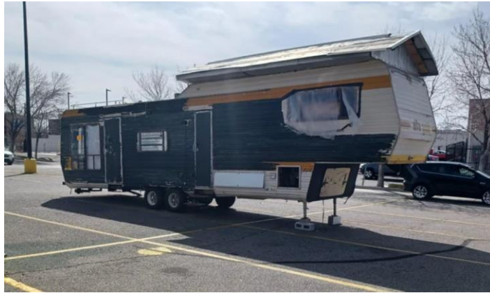
Seen in a Wal-Mart parking lot