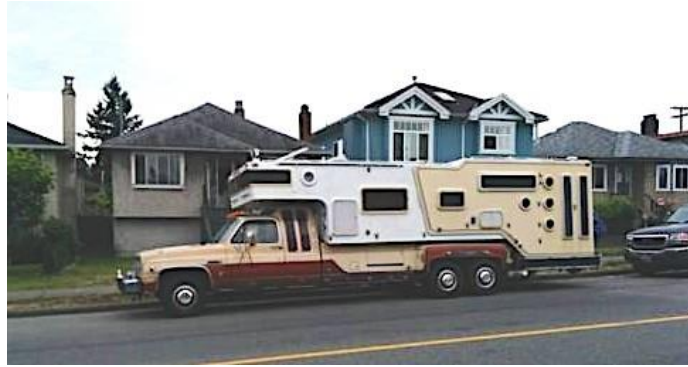
1955 Chevrolet Bel Air Motorhome