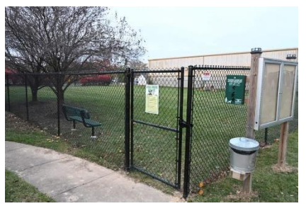
FMCA Campground, Cincinnati All FMCA members can stay free 2 days each month. Great place to stay when going to see the Arc.

Tire load ratings are great — provided you keep the tire at the recommended inflation rate. If the tire pressure is low, forget the weight ratings — you're playing with fire in the form of excessive tire heat that can blow your tire in flight.