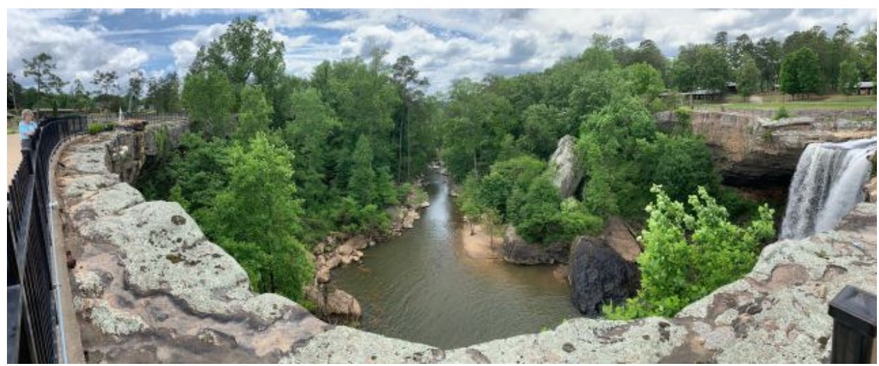
been. Heartbroken, the remorseful father gave the great cascade his daughter's name. Since that day the waterfall has been called Noccalula Falls.

Many of the park's campsites back up to the shaded banks of the beautiful Black Creek with its sparkling clear water, small rippling rapids, and rocky bottom.